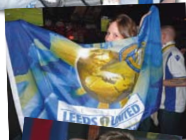
Going global: the International Members Club flag flies proudly in New York.